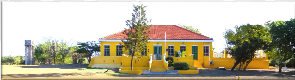
Landhuis Klein Kwartier

Centrally located in a quiet neighborhood, this historic country house, built in the late 18 th century, now serves as the Curacao Lions Club Den and as a multi-functional event venue for big and small groups. Surrounded by trees, garden greenery, a small plantation of fruits and vegetables called “Hofi Leon” and a beautiful fountain in the center. The spacious terrace at the back of the country house offers an ideal setting for outdoor events. Adjacent to the house there is a covered porch at the back and a cozy open-air terrace on the side suitable for smaller events and meetings.